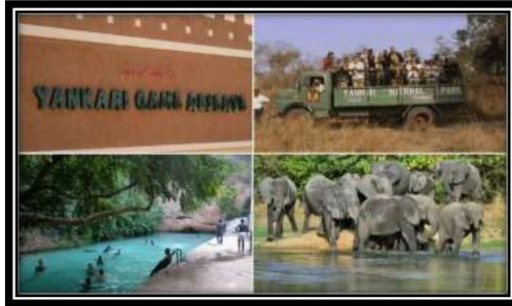
Our Culture, our Values